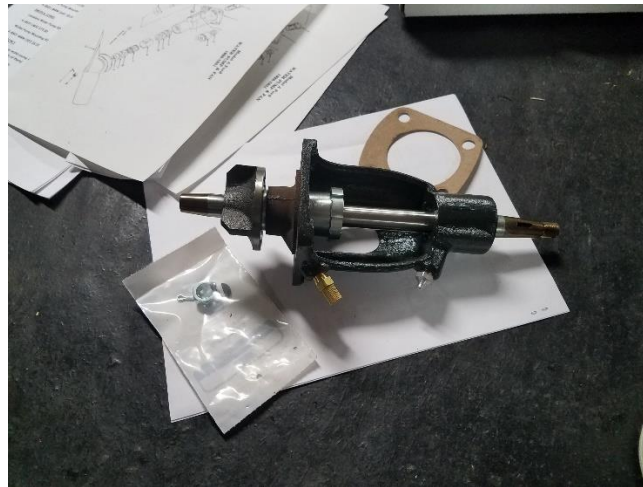
This is the leak less water pump with sealed bearings some lucky person will have.

The next MATTS meeting will be on Friday, June 1 st at 9 AM.