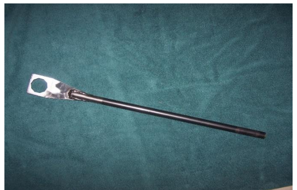
2. Wrench with welded 21inch pipe