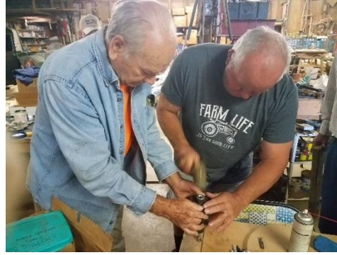
Easy does it!