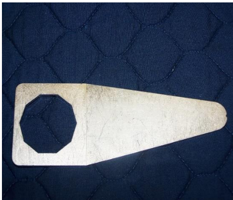
1. Tool without modification

Another tip, follow the advice from Les Andrews and use the 2 thin brass washers after placing a light coat of oil. This prevents the gauge assembly from turning when the outer ring nut is tightened.