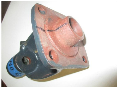
We found a crack (marked in black) that caused the leak in Sharon's water pump.