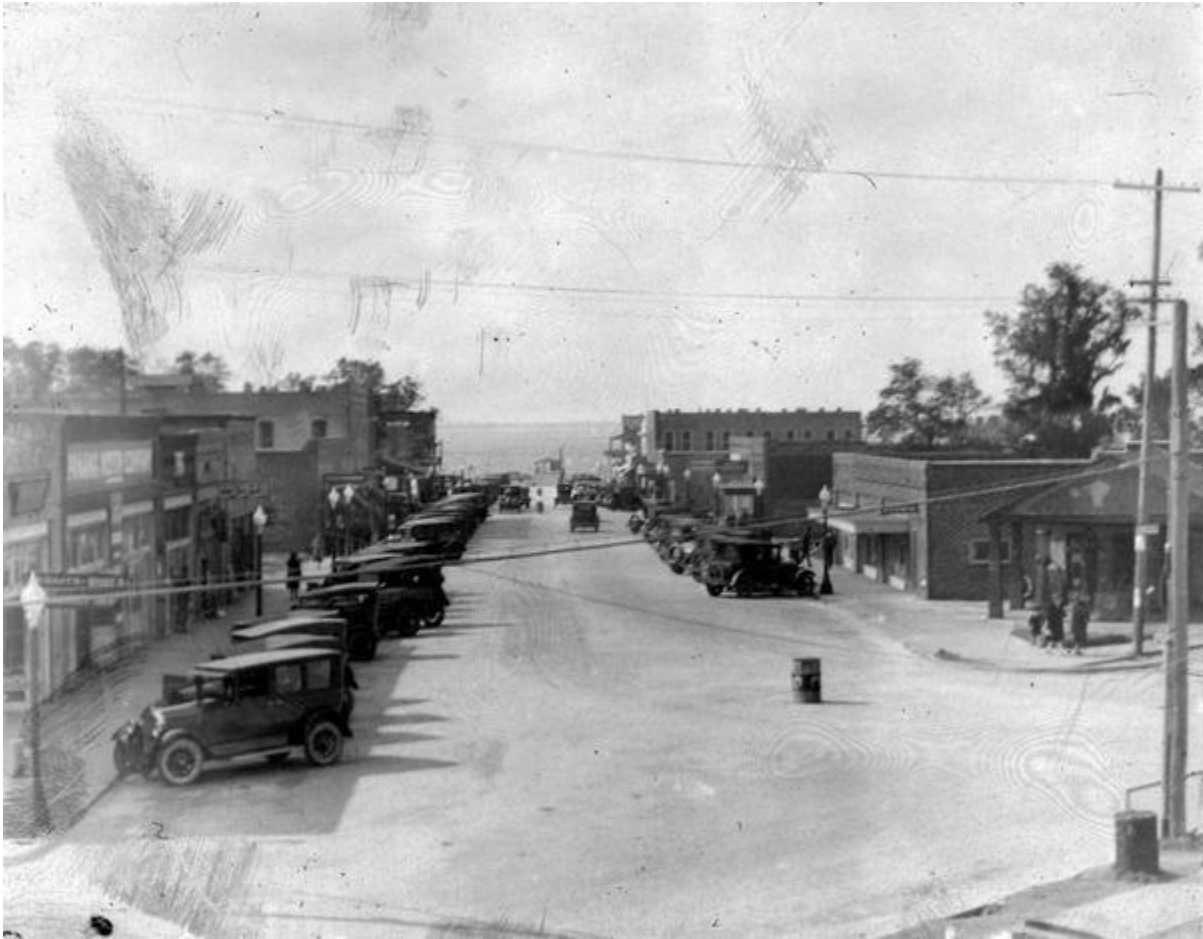
Harrison Avenue from old City hall - Panama City, Florida

Normally this spot in the Newsletter is for the club meeting Minutes, however due to the health alert, our meetings have been cancelled.