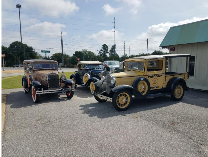
"More members' drove their Model "A"'s to MATTS"