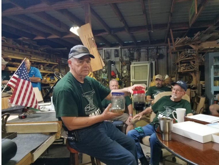
"Bobby also talks about the incredible Rust 911 product"...