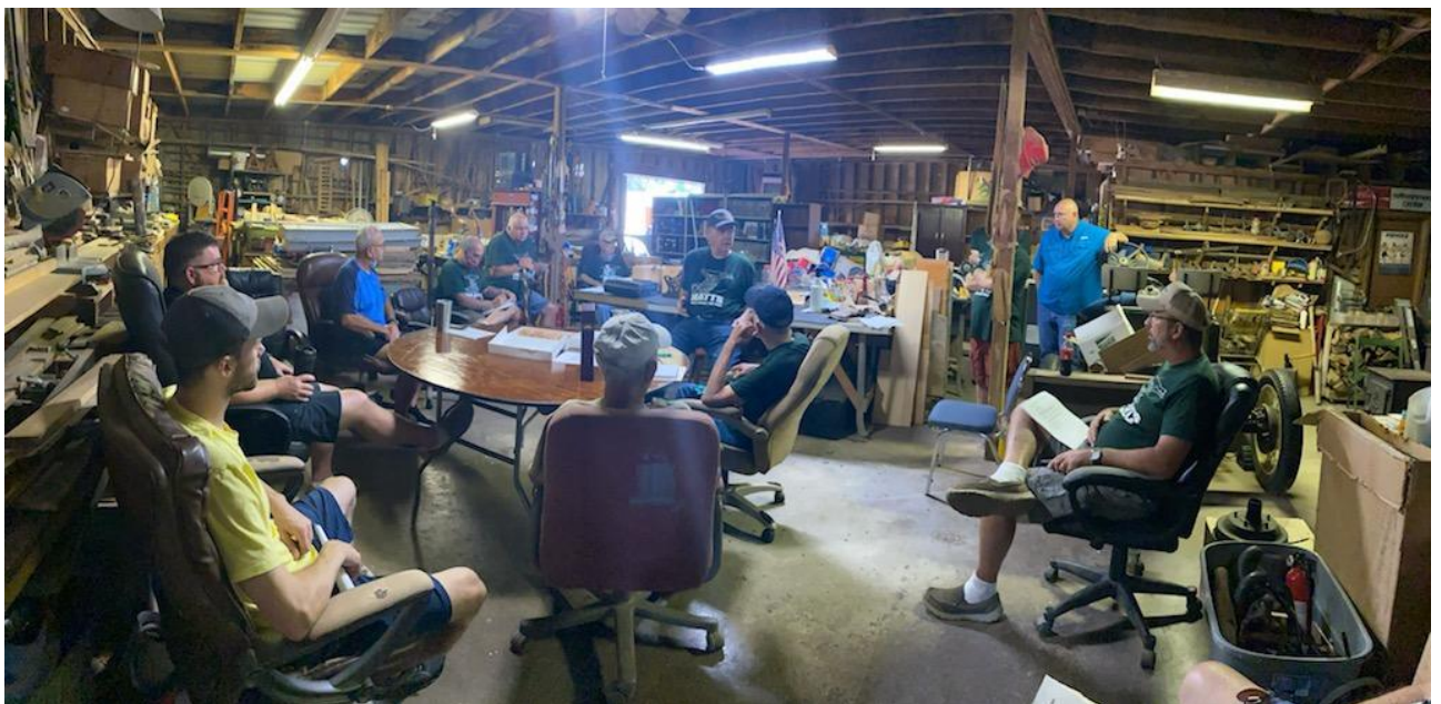
“Some of the members that attended MATTs...”