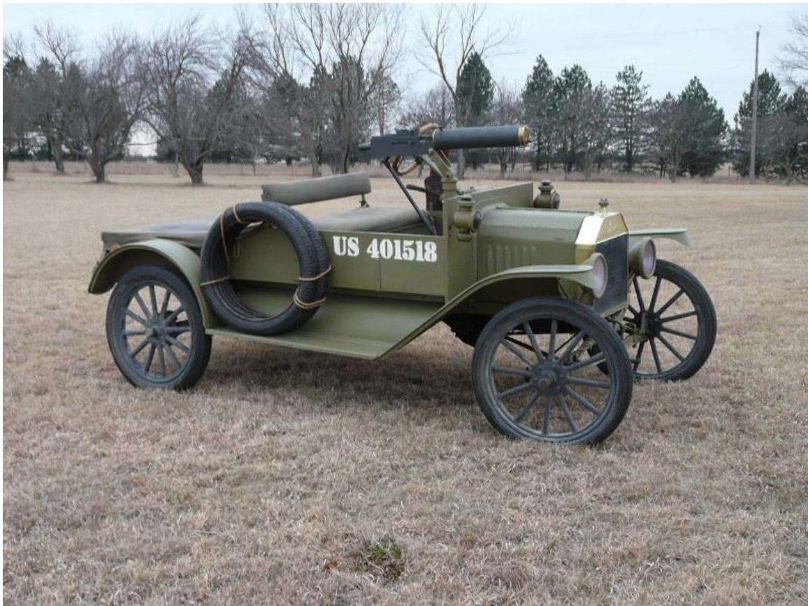
Model T Light Patrol car in WWI

jobs they were previously barred from, at the same time the importance of cooking, making, and volunteering took on new proportions for women as well. Though many of the women working in factories had to give up their jobs, and opportunities for women diminished as the men returned from war, women of WWI played a key role in the war effort both in industry and at home.