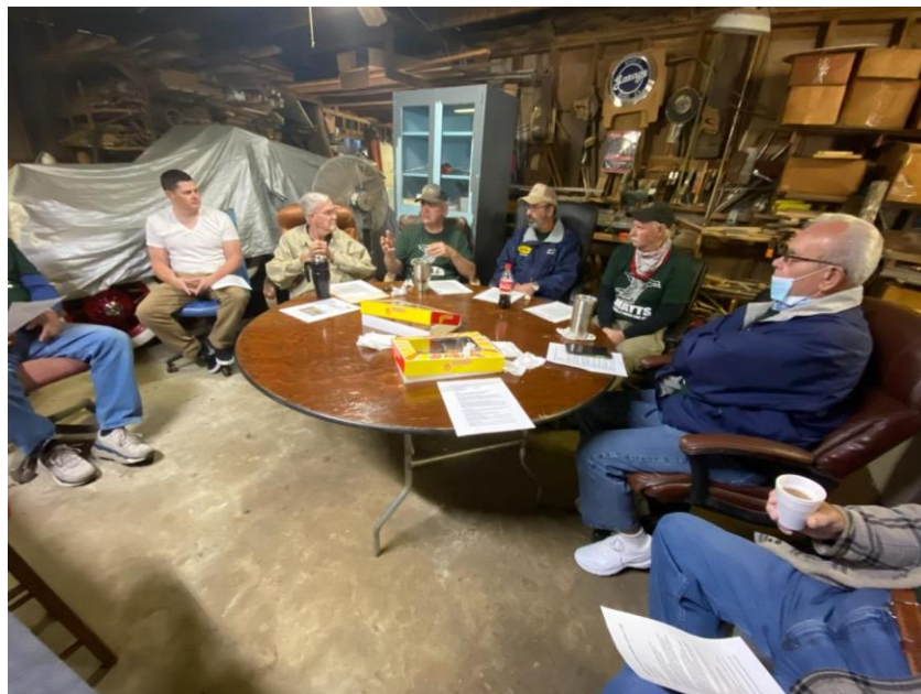
"Members join in the discussion of other issues..."