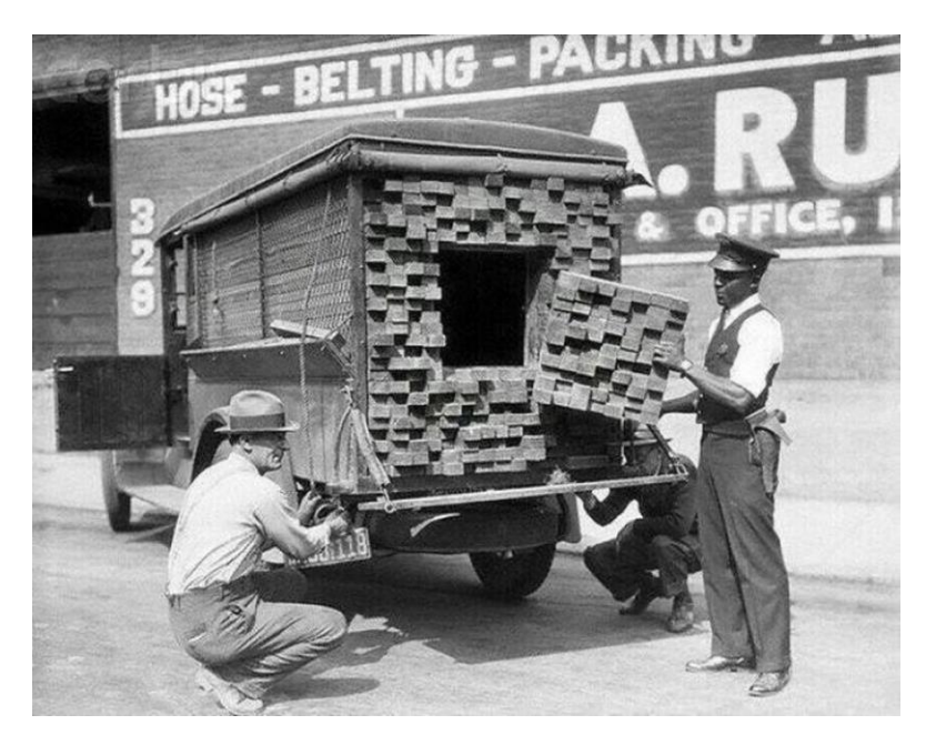
Moonshiners In Action, 1926