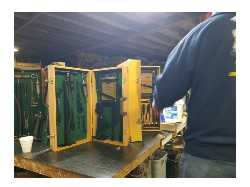
"Showing some of the components of the Model A Tool Kit." \dots