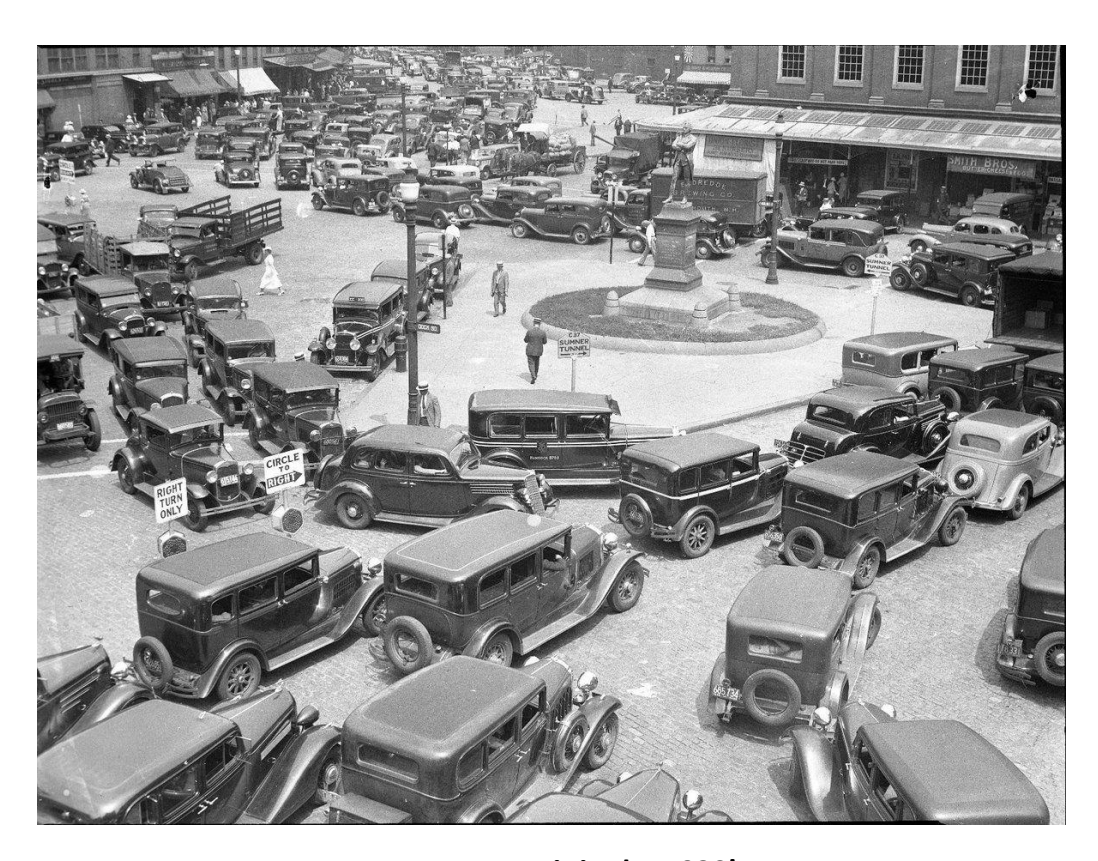
Detroit in the 1930's