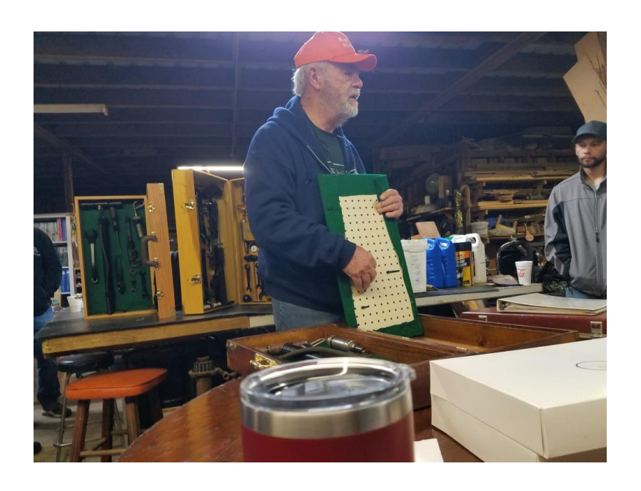
"He shows how the back side of the board looks like." Hope to see you at the next MATTS!