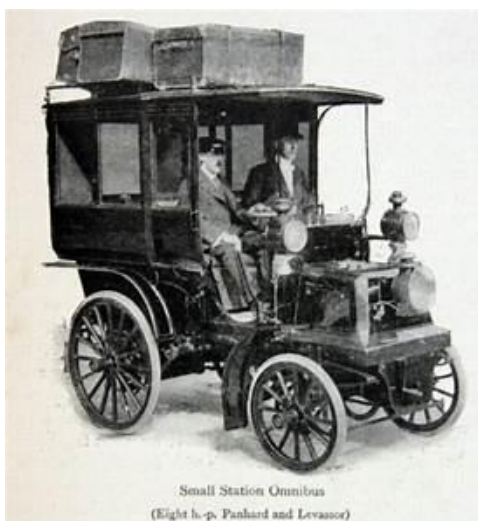
Small Station Omnibus (Eight h.p. Panhard and Levaux)

..... MAFCA AWARD WINNING NEWSLETTER, 2002-2009, 2011 and 2013 OLD CARS WEEKLY GOLDEN QUILL AWARD 2004, 2010