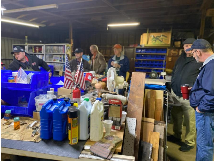
Before the MATTS presentation members enjoy talking to each other” ...