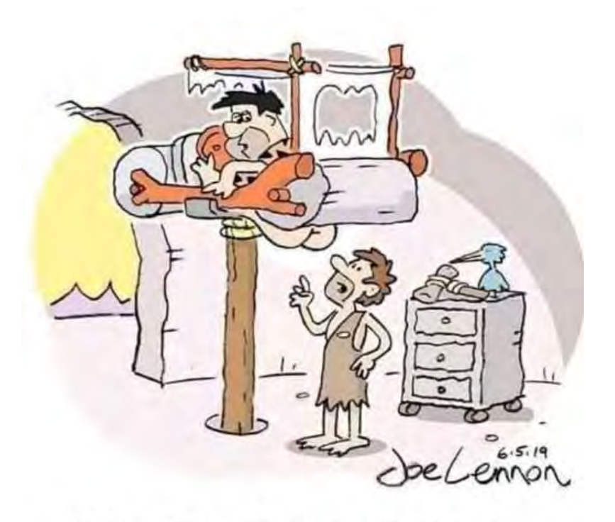
WELL THERE'S THE PROBLEM -YOUR EXHAUST SYSTEM'S SHOT.