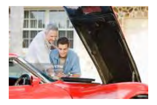
Happy Father's Day

MAFCA AWARD WINNING NEWSLETTER, 2002-2009, 2011and 2013 OLD CARS WEEKLY GOLDEN QUILL AWARD 2004, 2010