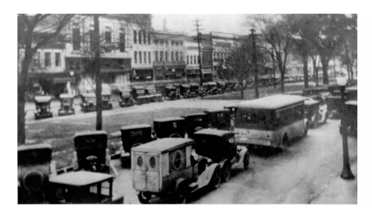
Boradway (Broad street) Back in the day

The Model A was the first Ford to use the standard set of driver controls with conventional clutch and brake pedals, throttle, and gear shift. Previous Fords used controls that had become uncommon to drivers of other makes and a rear-view mirror was optional! The Model A was also the first car to have safety glass in the windshield.