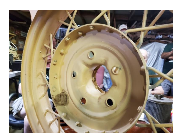
"Bobby showing a different type of a wheel used in the Model A, a Kelsey Hayes Wheel "...

"Al Lugo demonstrates how to mount a Model A tire using his feet" \dots