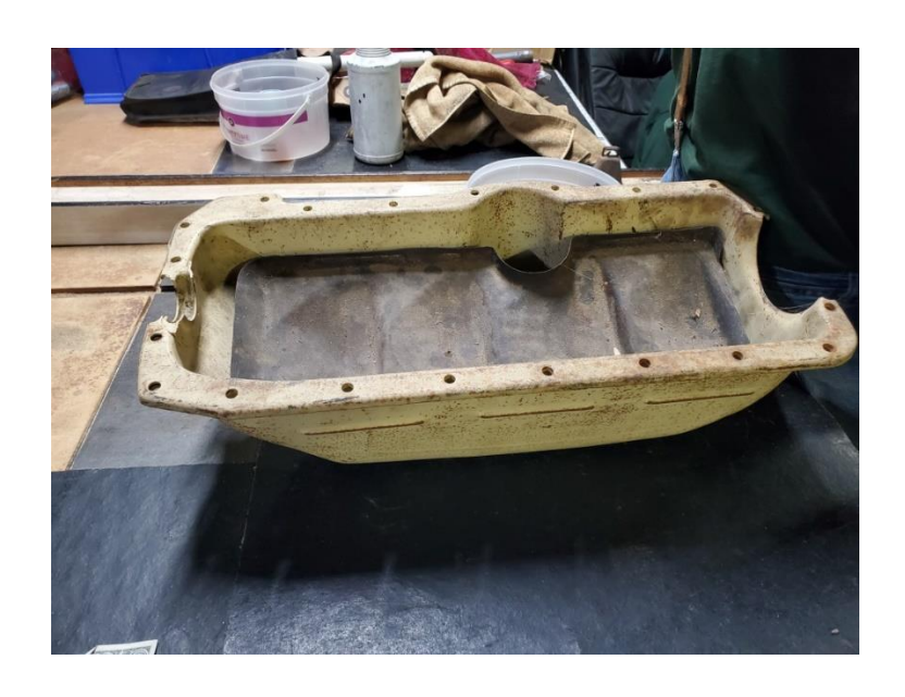
"Bobby talked about the engine oil pan, baffle, and the return tube" \dots