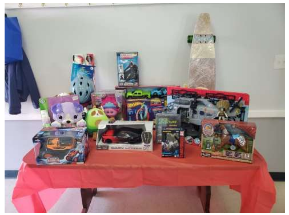
THE TOYS DONATED BY MEMBERS TO THE SALVATION ARMY