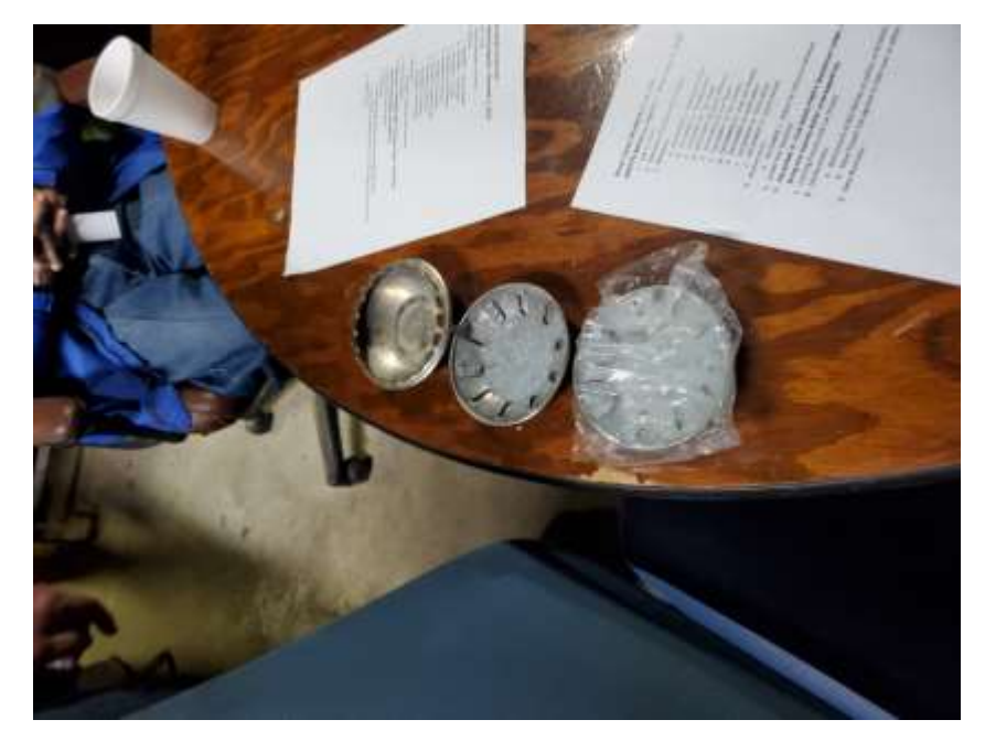
"Bobby shows different Model A Hub caps and some of the problems encountered in mounting them"... "Photo by Al Lugo"