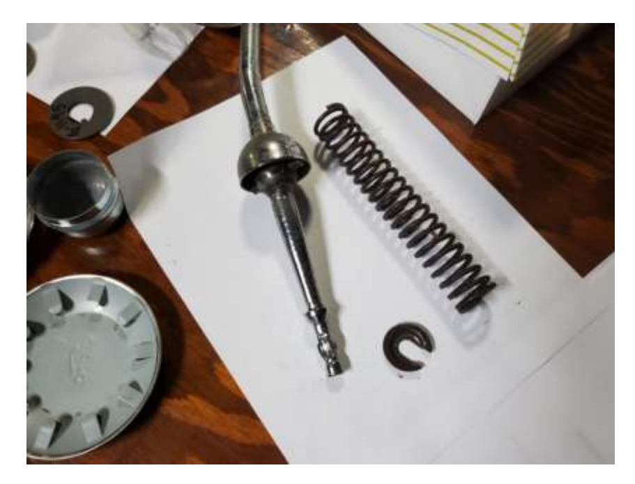
"AFTER AL HAD A PROBLEM PLACING THE RETAINING CLIP, BOBBY SHOWED THE COMPONENTS AND THE PROPER PLACEMENT"...