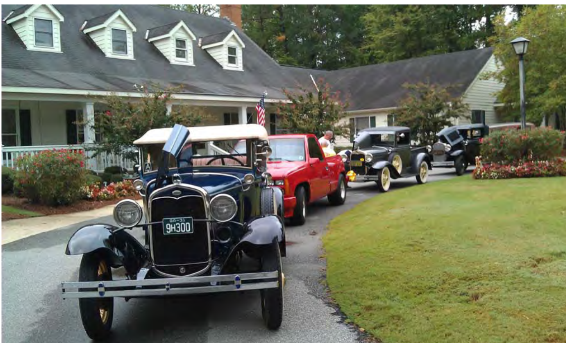
Several of the Members Cars...

I believe our mission for the day was accomplished. We drove our cars and we brought joy to the residents of the Nursing Home.