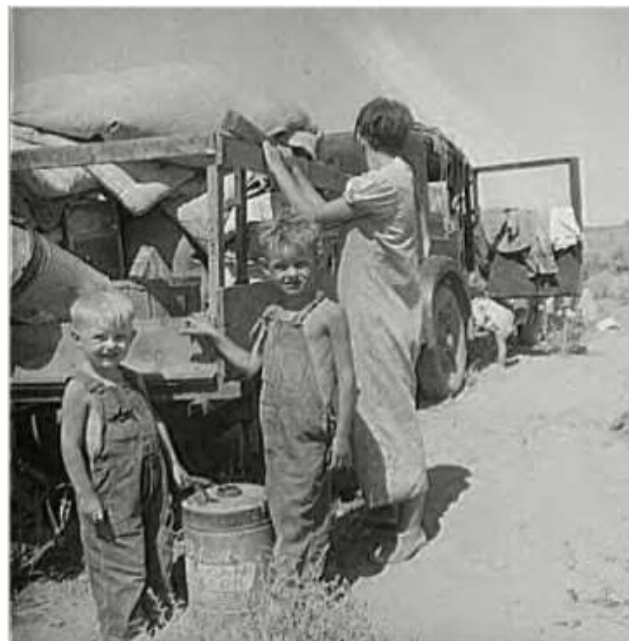
Taken during the Depression Days