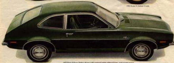
1972 Pinto 3 Door Sedan shown with optional white sidewall tires, and accent group.

When people shop for a small car, they look for some very simple basic values. Dependability. Economy of money and style. Good mileage and long life.