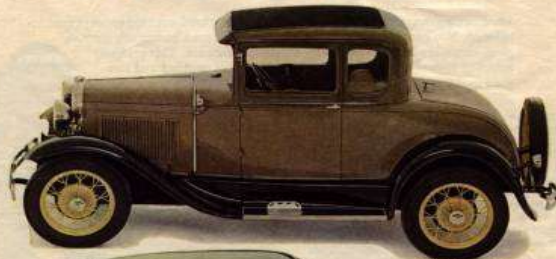
1928 Model A Sedan Coupe

We've invented the small sensible solid American car all over again.