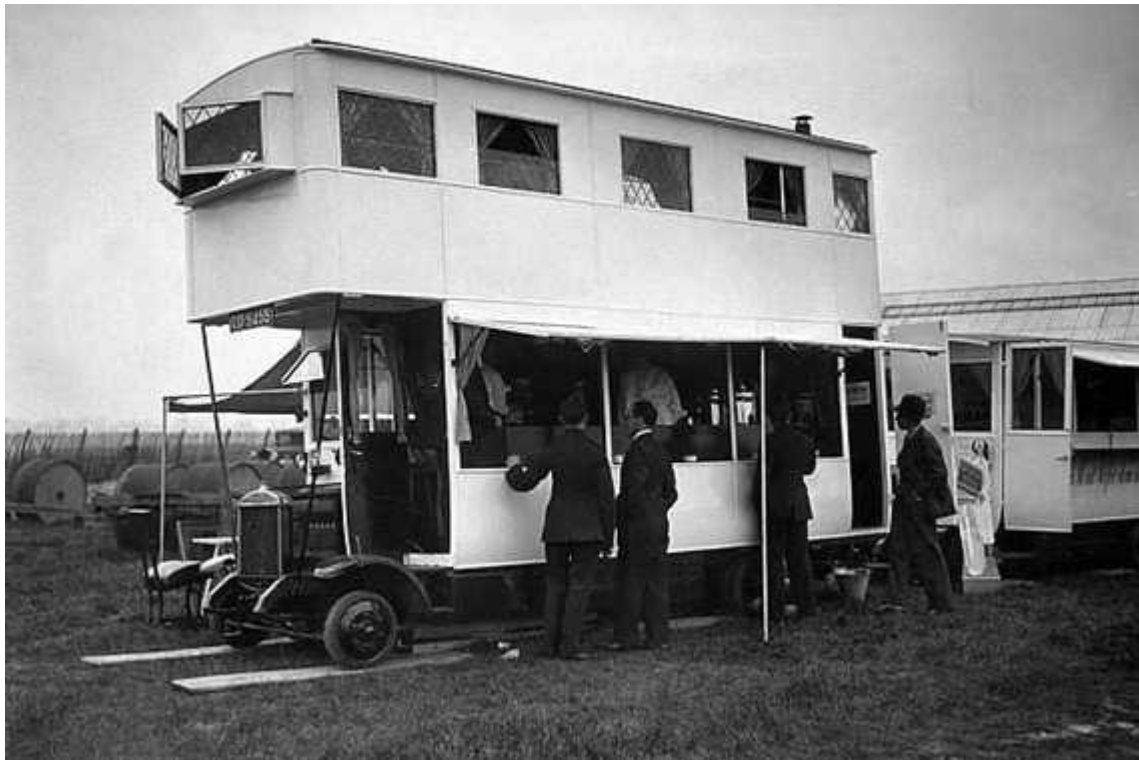
The first mobil lunch wagon?