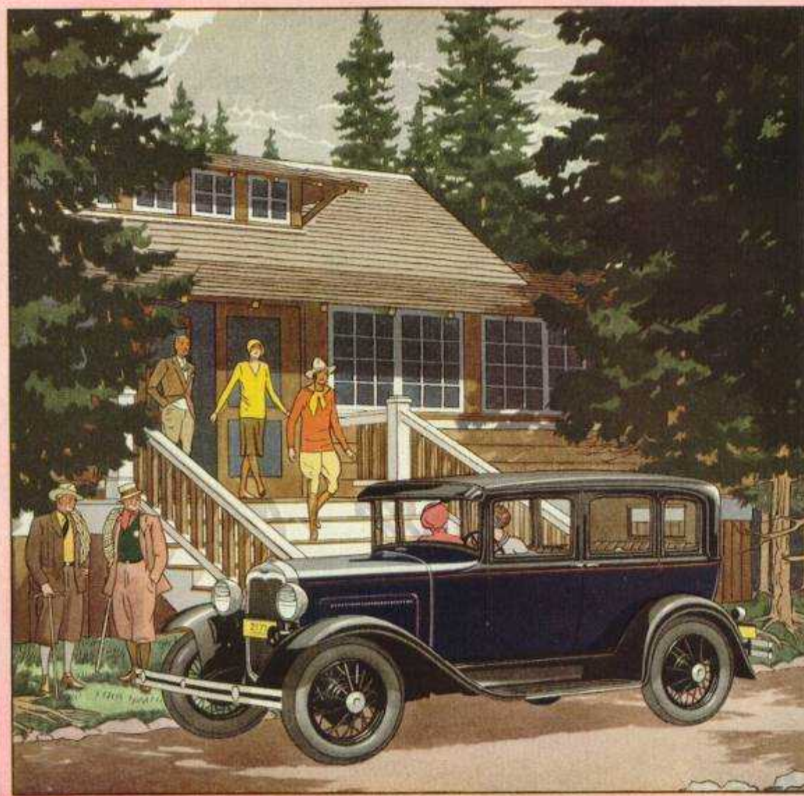
THE NEW THREE-WINDOW FORDOR SEDAN