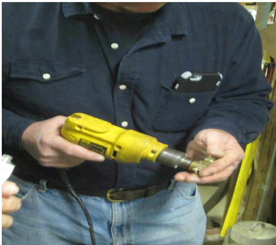
Fuel Valve tapered Surfaces Being Lapped Using Drill Motor