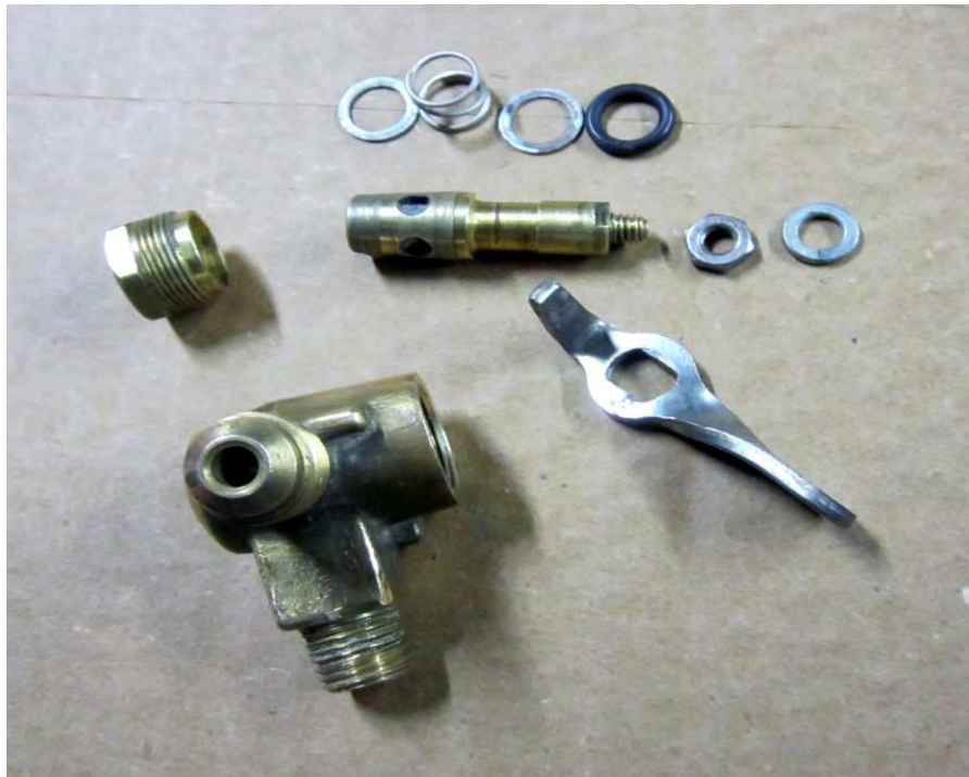
Disassembled Fuel Valve

Club members learned the inner workings of the fuel shut off valve. Bobby Penny told us how rust deposits from the fuel tank can contaminate the inner tapered surfaces of the fuel valve causing scoring and leakage of gasoline through the valve. If the carburetor float is incorrectly set this leakage can overflow through the carburetor to cause a potential fire hazard. We discussed how a scored valve seat can be lapped to correct leakage.