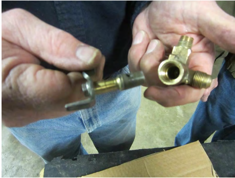
Tapered Surfaces of Fuel Valve Ready for Lapping