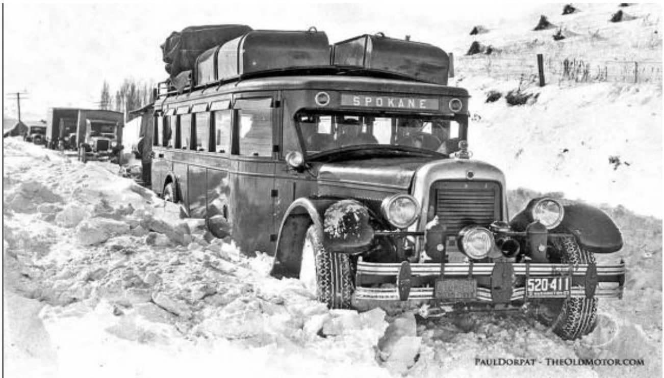
This photo was taken in Washington State of another snow-bound bus on its way to Seattle.