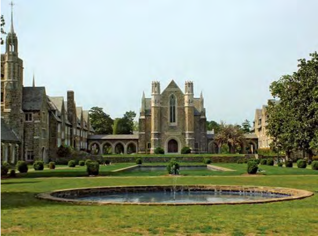
Ford Complex at Berry College, Rome, Georgia