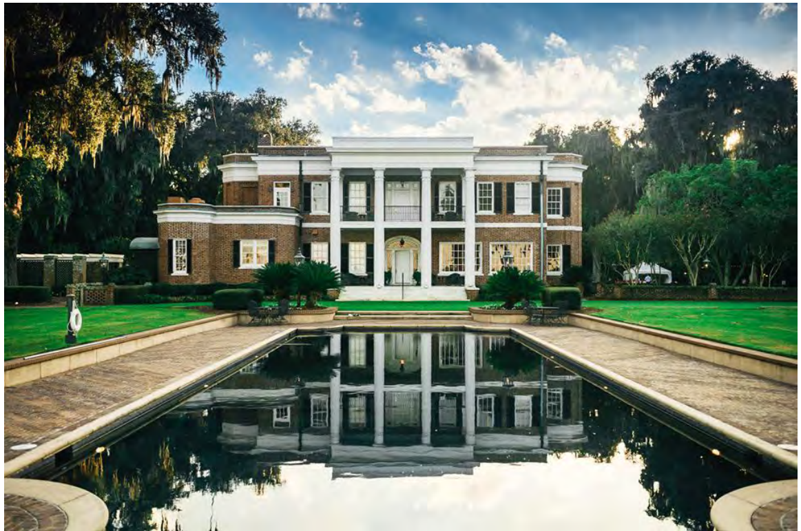
Richmond Hill Ford Residence, Richmond Hill Georgia