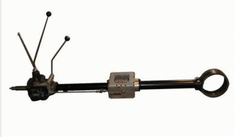
Mitchell Overdrive Kit

decide you want one for your Model A, call me today and we will get one ordered for you. Remember if we can help with any project on your Model A, please give me a call anytime at 678-407-1947.