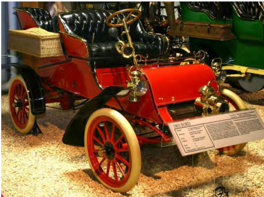
1903 Model A Ford