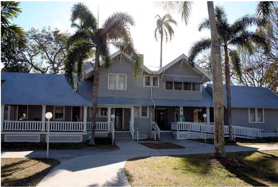
Henry Ford's Fort Meyers Winter Estates, "The Mangoes".