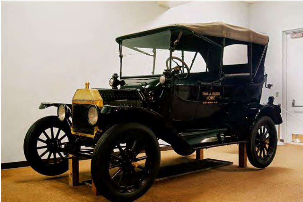
Original custom Model T, a gift from Henry Ford