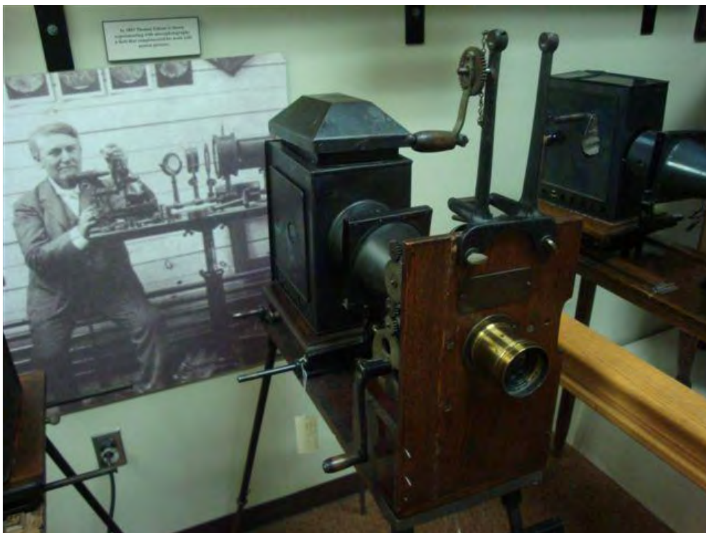
Edison's Movie Making equipment found in the museum