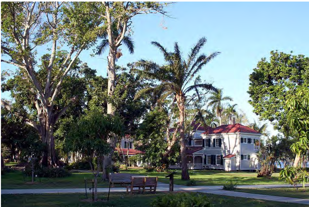
Thomas Edison's Winter Estates "Seminole Lodge"