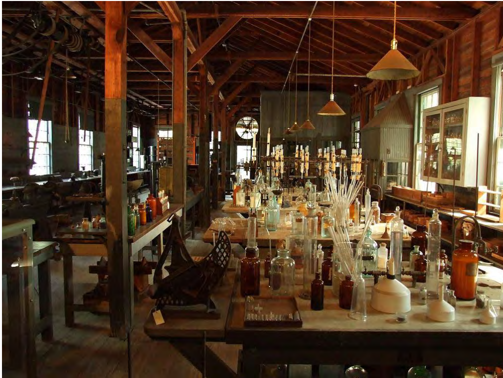
Edison's Botanical Research Corporation laboratory at the estate.