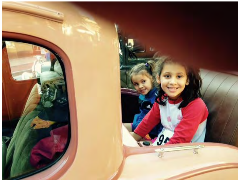
Two young ladies enjoying a seat in Joe's A