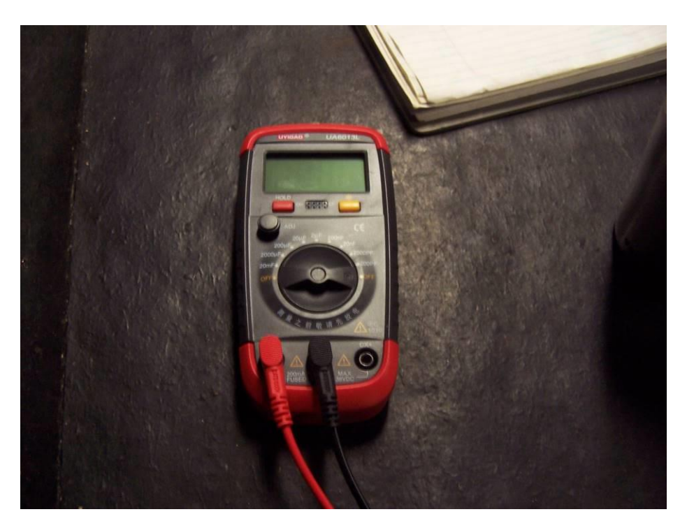
This is what the capacitor meter to check condensers looks Like.