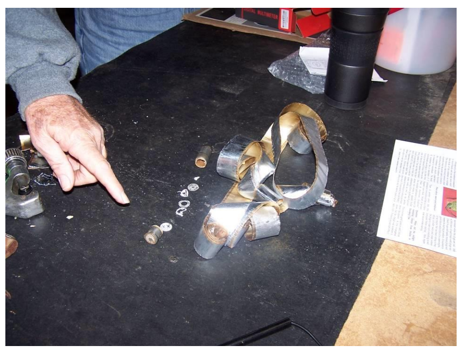
What is inside the condenser?