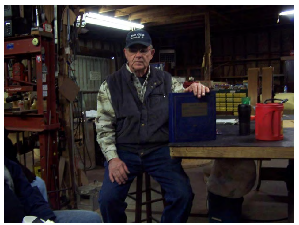
Working on your Model A? The best resource available for any Model A owner: The Judging Standards...