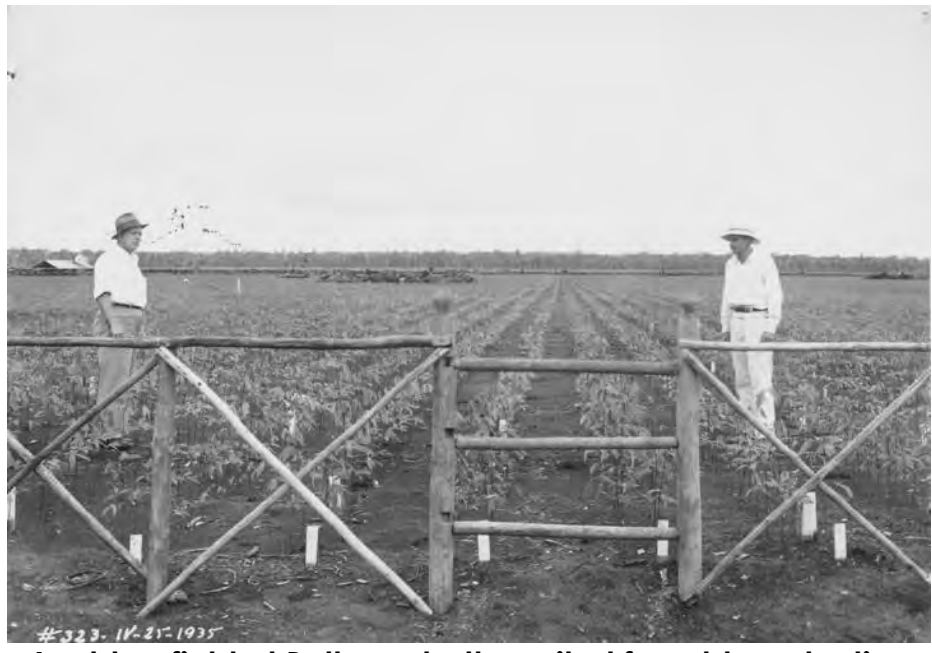
A rubber field at Belterra, better suited for rubber planting