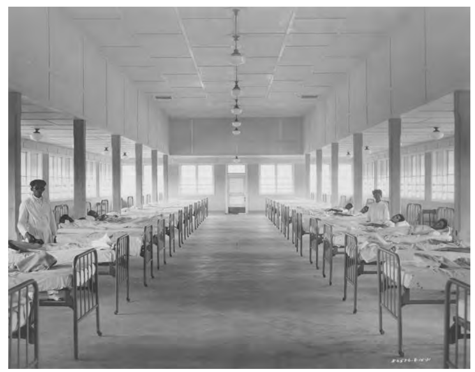
Hospital was well staffed and equipped