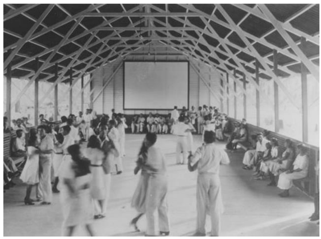
Dance Hall in Fordlandia