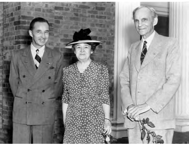
The Ford's during the opening of the Edison Institute (The Henry Ford Museum)...