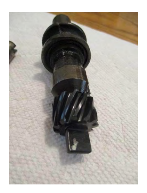
Oil pump/ Distributor Drive Gear

The valve chamber cover was then removed and the oil pump/distributor drive gear removed and examined and no trouble found.