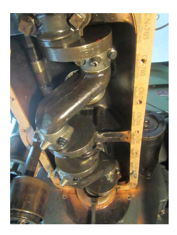
Installation of Pan

Note the pan gaskets were applied to the block. The pan was mated to the block using 4 guide pins screwed into the block's four corners.