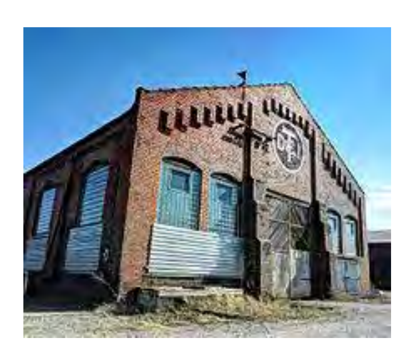
Old workshop for the DT&I railroad in Jackson, Ohio