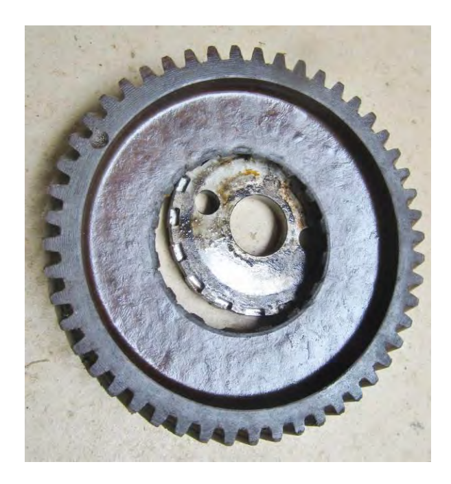
Failed timing gear is shown above Further Disassembly and Repair: