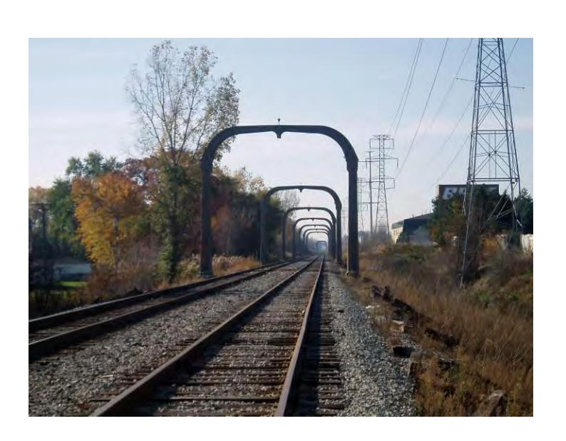
These cantenaries are located across the former DT&I railroad rails