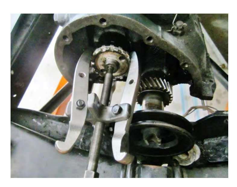
A gear puller was required to remove timing gear hub from the camshaft.