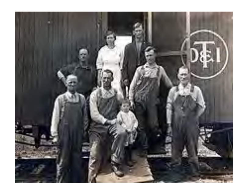
Railroad workers of the DT&I around 1921