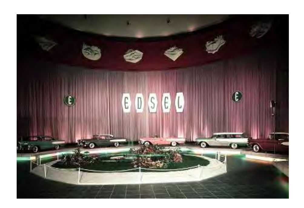
The 1958 Edsel introduction at the Rotunda...