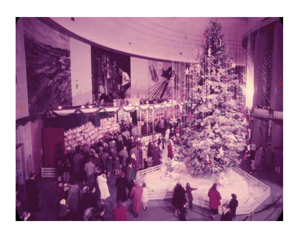
The Christmas tree and doll display at the 1955 Christmas Fantasy...