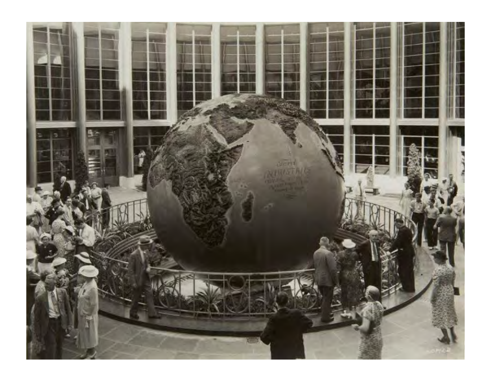
The Ford World exhibit...