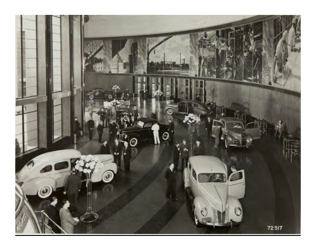
Ford Models for 1940 displayed in Ford Rotunda in 1939...