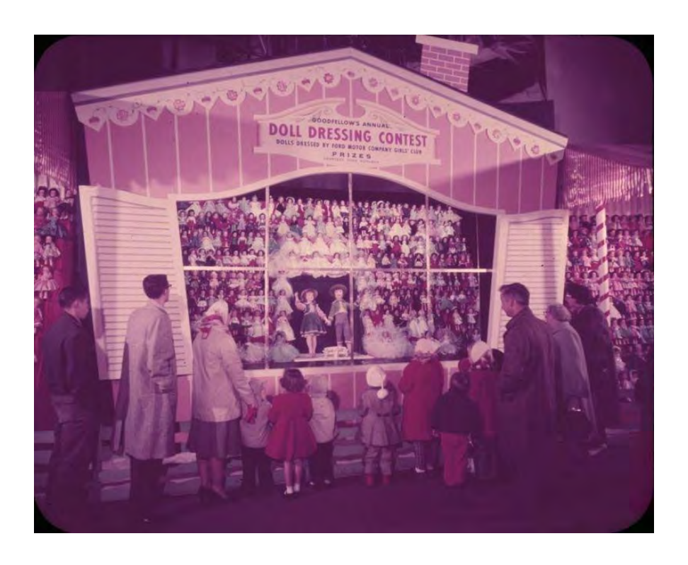
Visitors view dolls from the Ford Motor Company Girls Club Doll Dressing contest in 1958...