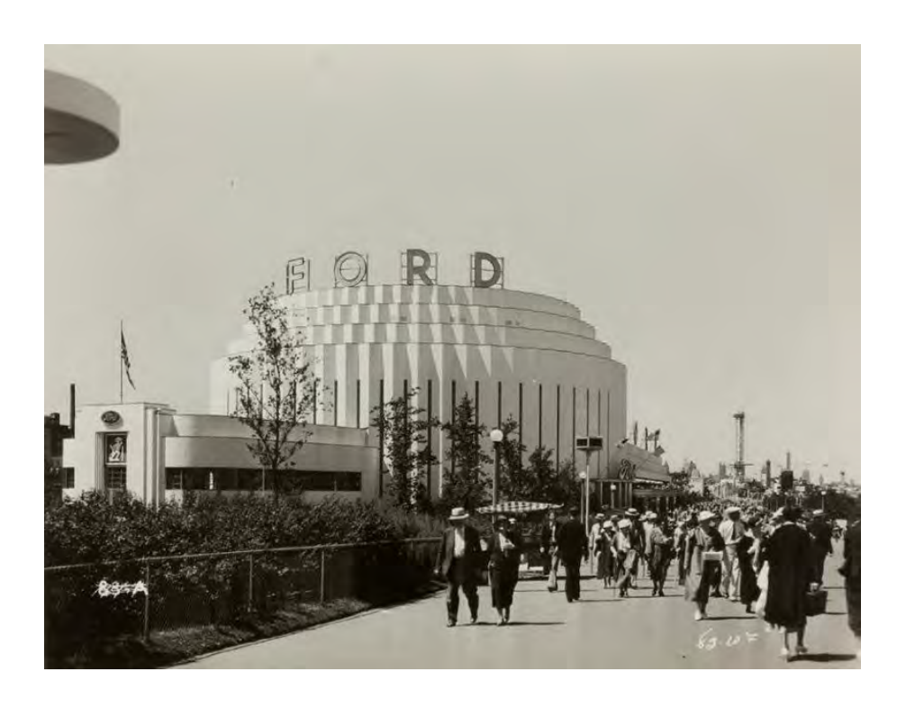
Visitors to Rotunda during the 1934 World Fair in Chicago...