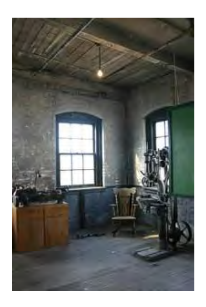
The third floor Experimental Room...