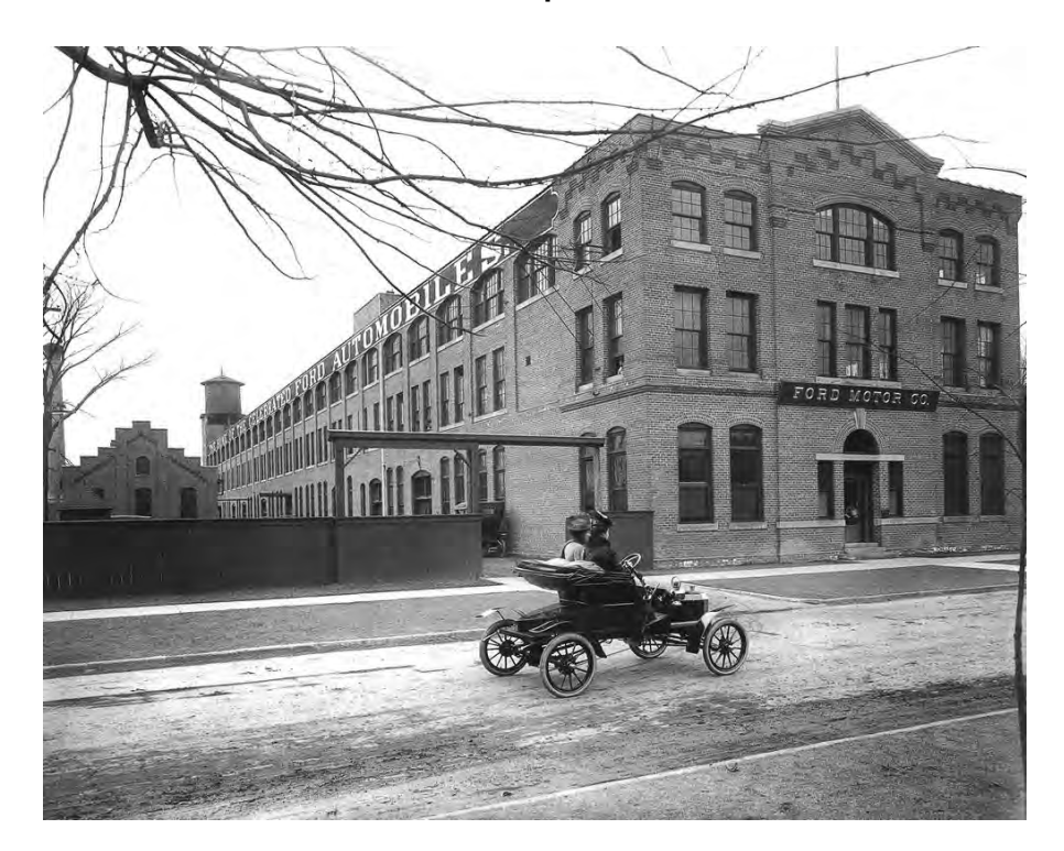
The Piquette Plant during the years that Ford Motor Company owned the plant...

The Piquette Plant has been designated as a Michigan Historic Site and is listed on the U.S. Register of Historic Places and declared a U.S. Historic Landmark. It is now open for tours, they host regular events and is available for rental for special events.