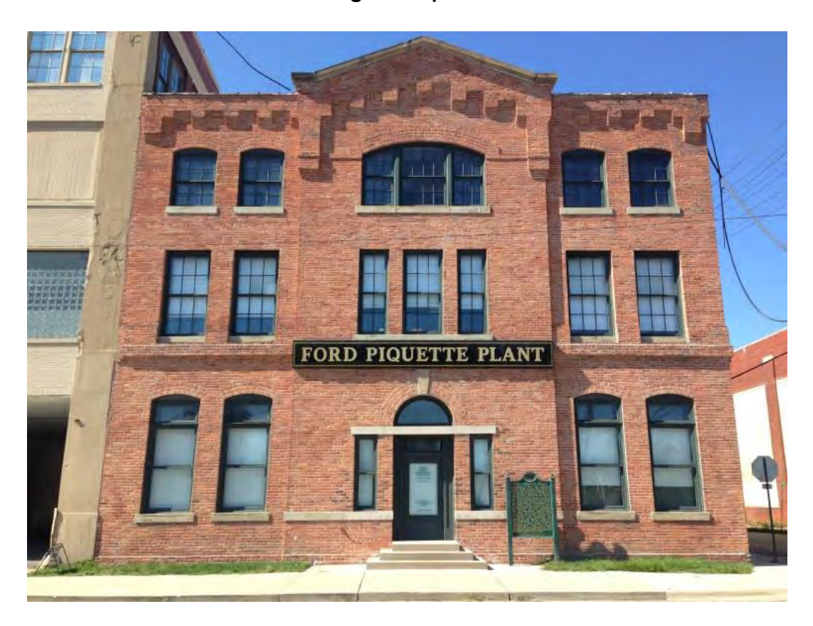
This is how it looks after restoration...