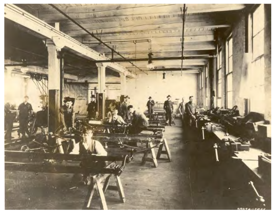
Ford employees building cars at the Piquette Plant before the assembly line...