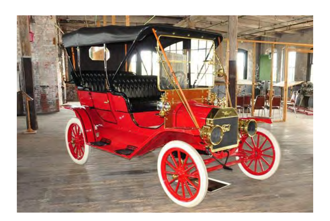
A 1909 Model T, one of the cars produced at the Piquette Plant...