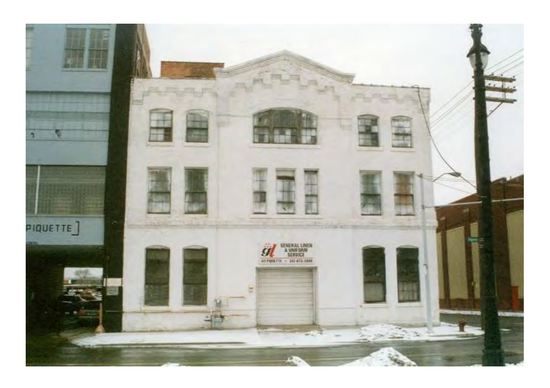
This was the appearance of the Piquette Plant before it was restored by the Model T Automotive Heritage Complex...