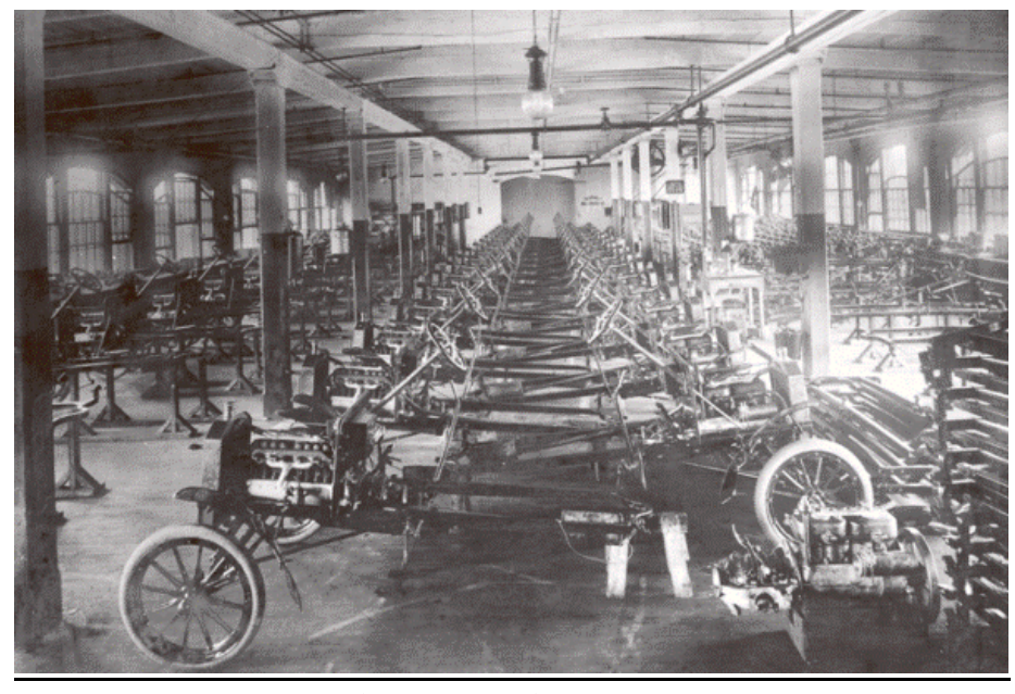
Assembly line at the Piquette Ford Plant...