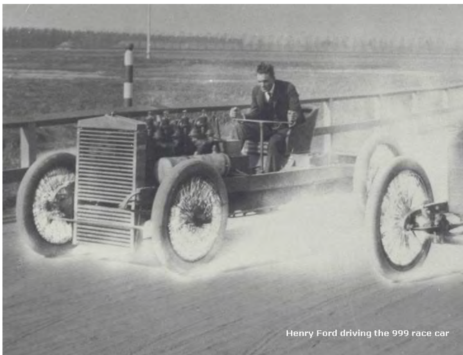
Henry Ford driving the 999 race car