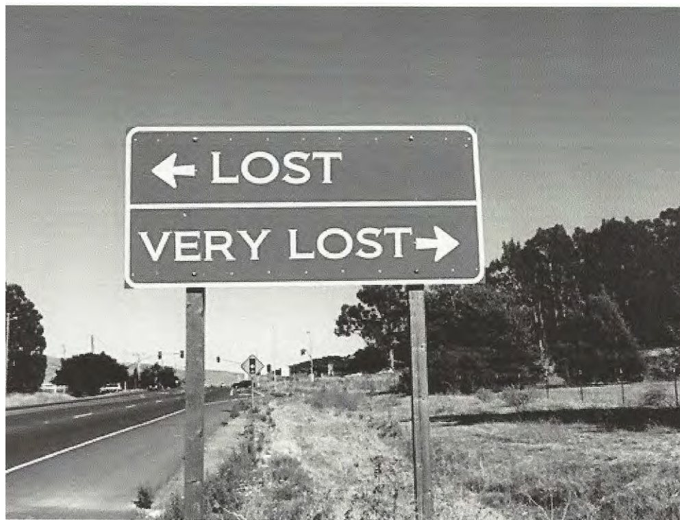
This is how I feel when I try to find a Lee County Road in Lee County AL