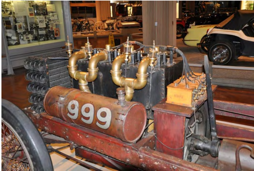
The massive engine in the Ford 999...