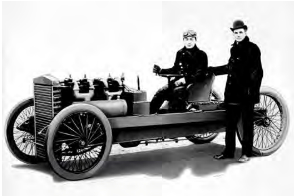
Henry Ford and Barney Oldfield and the Ford 999...