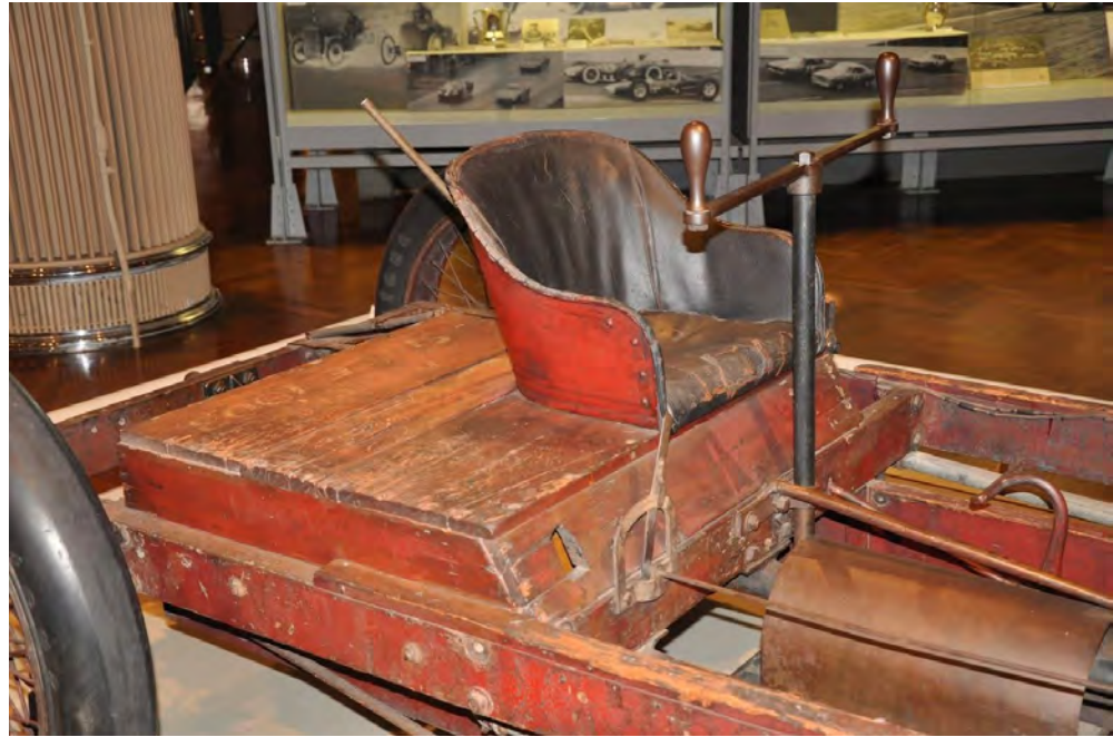
Notice the wooden frame and the crude steering...