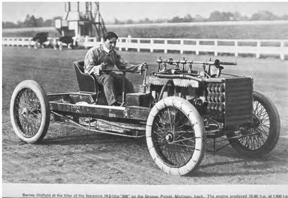
Barney Oldfield at the tiller of the fearsome 16.2-litre "999" on the Grrosse Pointe, Michigan, track. The engine produced 70-80 h.p. at 1,500 r.p.m.