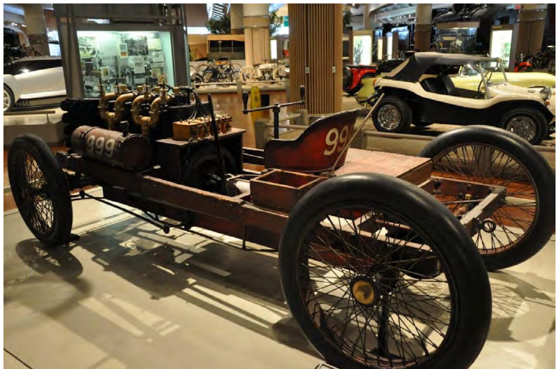
The Ford 999 at The Henry Ford museum...