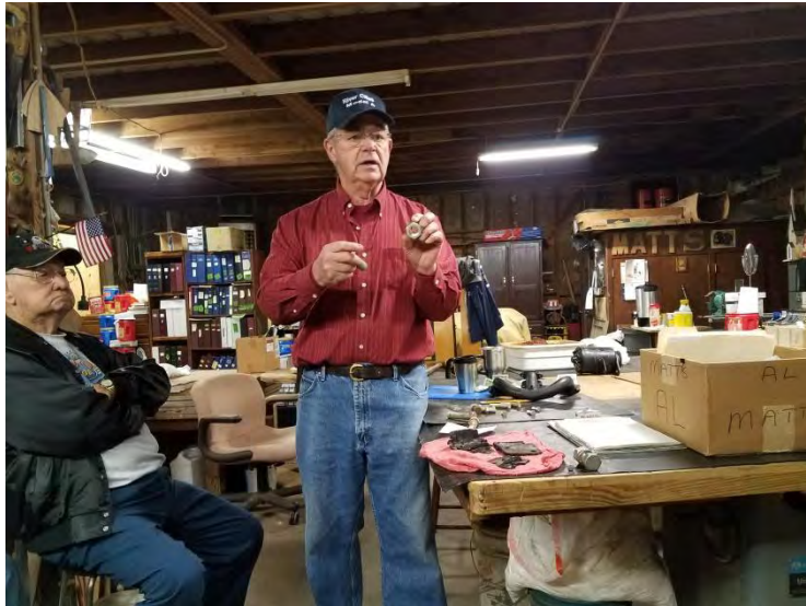
He also talked about bolt fatigue...