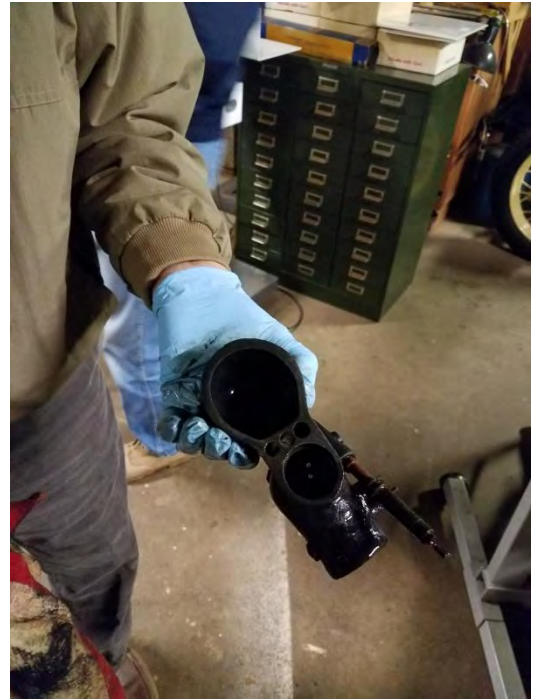
When he took it out...