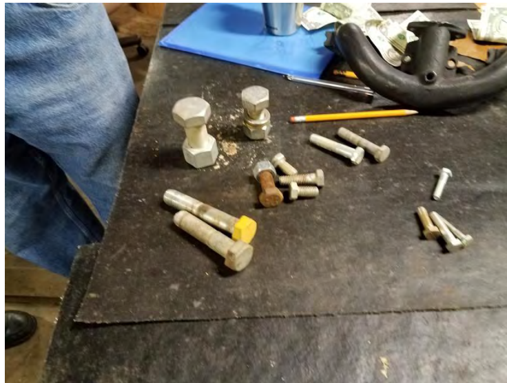
Bobby talks about different bolt grade ...