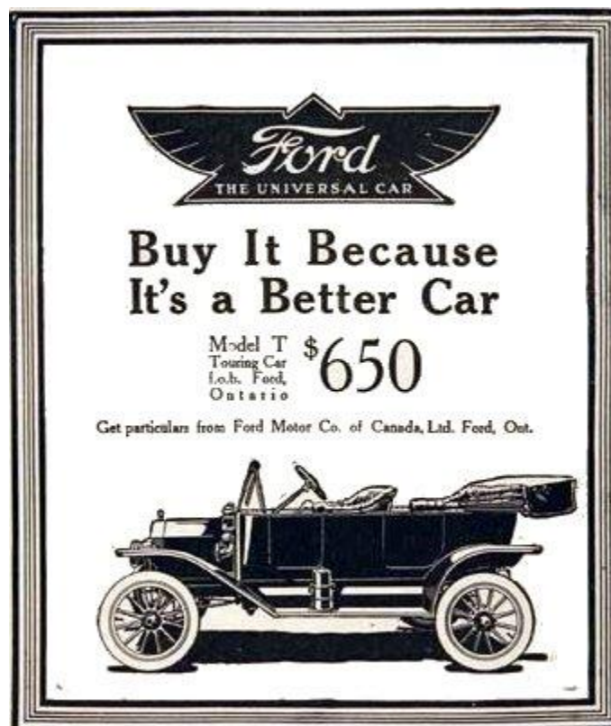
An example of a slick Ford car advertisement

1914 The first electric traffic light was installed in Cleveland.