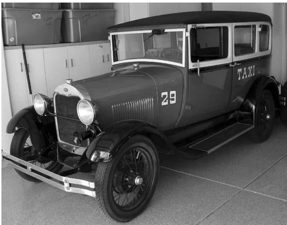
This restored Taxi was donated to the Model "A" Ford Museum at Gilmore...